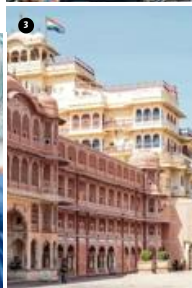
PURE JAIPUR Clockwise from top: 1. A view of Jaipur from Nahargarh Fort; 2. Showing off a bridal necklace of diamonds and pearls at Gem Palace, one of the city's iconic jewelry institutions; 3. Jaipur's City Palace; 4. Carrying flowers at Phool Mandi; 5. Arranging a table-setting at Rajmahal Palace; 6. Bar Palladio, a bar with dramatic East-meets-West interiors.