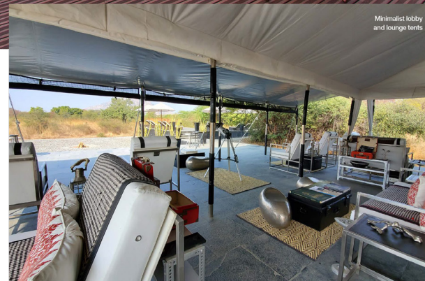
Minimalist lobby and lounge tents