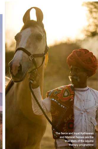
The fierce and loyal Kathiawari and Marwari horses are the true stars of the equine therapy programme

deep-red lehengas and dupattas , gold naths and white churas ), but also with photographs inside the tents that highlight their colourful attires.