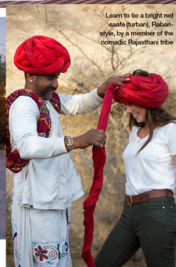
Learn to tie a bright red saafa (turban), Rabari-style, by a member of the nomadic Rajasthan tribe