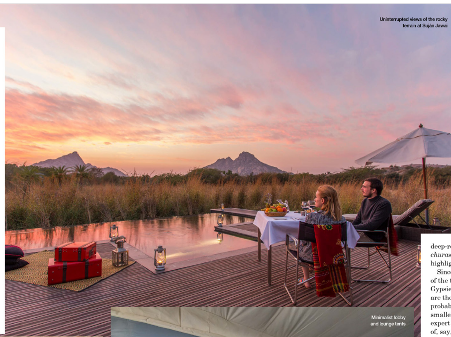
Uninterrupted views of the rocky terrain at Suján Jawai

In stark contrast to the rugged, rocky landscape are the scarlet turbans of the Rabari herdsmen and herdswomen who roam the area with their flocks of sheep. Suján Jawai pays homage to them by not only organising strolls with this fascinating pastoral community (the men wear white angarkhas and dhotis with majris , while the women wear