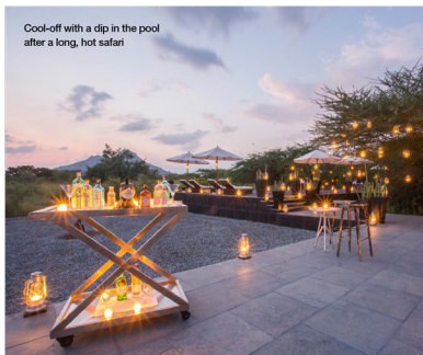
Cool-off with a dip in the pool after a long, hot safari