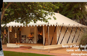
Tents at Sher Bagh come with wild atmosphere