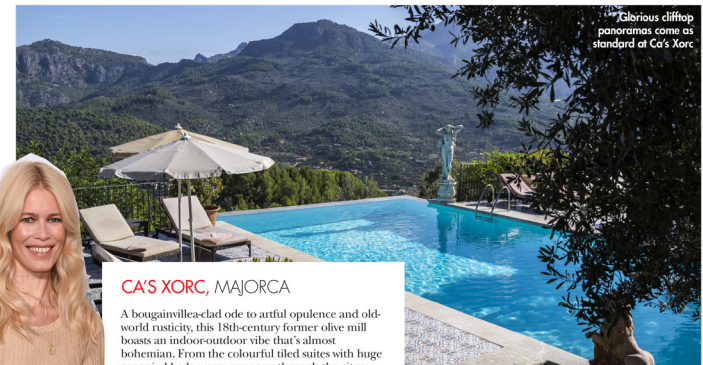
Exquisite cliff-top panoramas come as standard at Ca's Xorc.