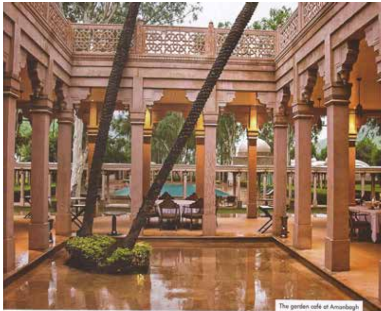
The garden cafe at Amanbagh