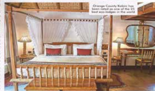
Orange County Relais has been rated as one of the 25 best eco-lodges in the world

In between game drives, stringently placed mud decks with chapeyas or loungers invite guests to relax and feel the pulse of the surrounding forest. And the icing on the cake is the swimming pool with its all-embracing view of the reserve beyond, where one can laze with a