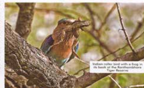
Indian roller bird with a frog in its beak at the Ranthambhore Tiger Reserve