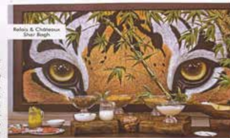
Relais & Châteaux Sher Bagh

As we drove past the gate of The Serai Bandipur, we saw a leopard draped on a tree outside the resort, eyes a-gleam with menace. This was the shape of things to come—The Serai's promise to unveil the Kipling-esque jungles of Bandipur in all their beauty and mystery, even as guests revelled in the comfort of its teak log huts and courtyard rooms.