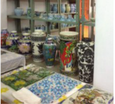
Blue pattery of Jaipur

at chapati and other staples. Home-cooked meals are included. Popular with Western and Indian guests, the atmosphere invites people to mingle, laughter resonates, and conversations broached all the taboos of politics, culture, and religion. Rooms are spacious, quiet, and comfortable with elements of regional décor. Located next to a park with a lovely walking/jogging path. guests enjoy private baths with hot showers, television, a handy writing desk, and a rooftop swimming pool making this a highly-rated stay in Jaipur.