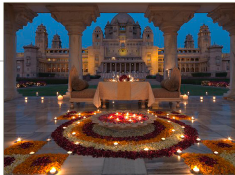
Umaid Bhawan, Jodhpur

In anticipation of the Duke and Duchess of Cambridge's visit to India and Bhutan, bespoke tour operator, Ampersand Travel, has created an itinerary to showcase the links between England and the Indian Subcontinent, existing since the days of the Raj. This 24-night all-suite itinerary to Rajasthan and Bhutan suggests palaces and hotels that hold a personal connection for their Royal Highnesses (not least as sources say that William is keen to see a tiger and visit his father's old friends in Rajasthan).