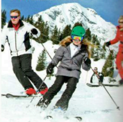
King Willem-Alexander, Princess Alexia and Queen Máxima of the Netherlands in Lech

Powder is king in Canada's Whistler, and nowhere more so than at the HELI CHALET , which sits on seven acres with its own helipad for extreme aerial ski-in and ski-out. Along with five bedrooms (and two more at a nearby guesthouse), there's an outdoor heated pool, hot tub, steam room, gym, cinema, loads of Lego (if the snow gets boring) and children's books in the library. Best bit: the concierge does the dreaded removal of children's ski boots. BOOK IT The Oxford Ski Company ( oxfordski.com ; 01993 899 420) offers seven nights from £85,000 for 10 people, including breakfast, guided ski-touring, a concierge and a private chauffeur; flights not included. □