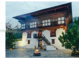
Above: a restored farmhouse is at the heart of Amankora Penakha Lodge in Bhutan

→ Wilderness Safaris has operated in Mana Pools National Park – in ZIMBABWE 's remote but game-rich north – for years, running its 10-tent Ruckomechi Camp. Last May, I stayed at Little Ruckomechi ( wilderness-safaris.com ; from $1,045 per person), a then brand-new private camp just downriver, on a bluff overlooking a broad wetland. It's a testament to the power of intimate dimensions to convey great luxury: just three canvas-and-timber tents and two open-air living/dining areas dotted with comfy club chairs, deep sofas and stacks of