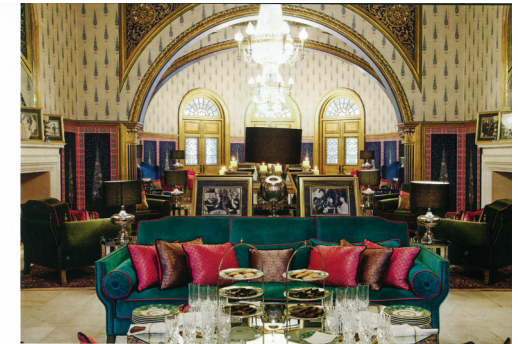
Above: Jaipur's Suján Rajmahal Palace's ravishing mix of Rajput heritage and Anglo glamour. Below: the industrial-slick lobby/bar at The Warehouse Hotel on Robertson Quay, Singapore

the hotel he heads up on the outskirts of JAIPUR 's old city, is a ravishing compendium of Rajput heritage and Anglo glamour. Its 14 suites bear the names of the guests who slept in them: Mountbatten, Kennedy, Prince of Wales. It's stuffed with important antiques and good paintings, and 48 individual wallpapers were custom-designed for the many halls, receptions and arcades of the palace – once home to the British resident political officer of Rajputana, then to Sawai Man ("Jai") Singh II, Jaipur's very modern and last ruling maharajah. It's a maximalist's dream, underpinned by some of the finest service in the land – and an outrageously good thali to boot.