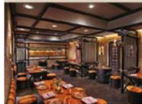
Peshwari at ITC Rajputana

➤ Jaipur Palace Road, Jaipur Rajasthan 302006, India +91-141-810-0100