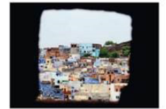
India adheres to a strict caste system. The highest caste is represented by the colour blue and is believed to be closest to the gods. Thus, it used to be that someone who owns a blue house in Jodhpur belongs to the esteemed caste. Today, some locals believe the colour blue can repel mosquitoes and keep houses cooler. 印度有严格的种姓制度，最高种姓代表的颜色是蓝色。因此，在久隆浦城内拥有蓝色房子的人，被认为是种姓中最高级的人。据说蓝色还可以驱除蚊虫并让房屋更凉爽。所以把房子刷成蓝色，日子一久成为久隆浦的代表色。