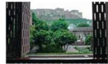
Mehrangarh Fort, built using yellow sandstone in the 15th century, is one of the largest forts in India. The majestic structure stands 120m above Jodhpur, making it visible from any part of the city, including from the room of Raas Jodhpur. 梅兰加哈尔堡垒于15世纪建造，以黄色砂岩建造而成。堡垒高达120米，从城市任何地方，都能看到，包括从Raas酒店的方向。