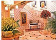
Treasures abound in the Sojan Rajmahal Palace hotel. One of them is the white piano in the lobby which was a gift to the hotel from Queen Elizabeth II the year after her visit to the hotel. Countless dignitaries have stayed at the hotel, including Jacqueline Kennedy Onassis. 珍宝随处可见在苏让宫殿酒店。其中之一是白色钢琴在酒店大堂，是女王伊丽莎白二世在离开酒店后一年送给酒店的礼物。无数名流曾入住过酒店，包括杰奎琳·肯尼迪·奥纳西斯。