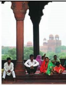
The Jama Masjid, located along the busy Chawri Bazar Road in the heart of Old Delhi, is one of the world's three largest mosques. From the top of one of the mosque's minarets, you can view the cityscape of nearby Old Delhi as well as admire the historical Red Fort from afar. 位于印度德里中心的贾马清真寺，是世界上最宏伟的清真寺之一。从清真寺的尖塔顶端，你可以欣赏到德里老城的全景，以及远处的红堡。

洲闻名最珍贵的建筑群之一。关于这个地方有很多传说。它是一座整个城市和其他几座小城的几代人一夜之间建造起来的。考古学家也找不到原因。有些人猜测是地壳运动造成的。当地人认为，地震内流电力供应，但午夜时分常有光和声响传出。一些曾在午夜进入的人自述没出来过。这些当然是传说。我在白天去逛了一遍。人潮涌动，人气旺旺。一点都不觉得森。