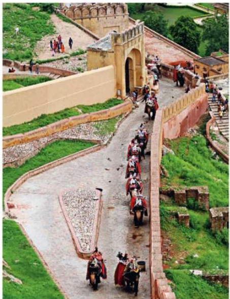
Amber Fort (also known as Amer Fort), which the Raja Man Singh began building in 1592, took 125 years to complete. There are three ways to scale Amber Fort: hike up on foot, drive up or take an elephant ride. 1992年由拉贾曼辛格王开始建造，历时125年完工的阿梅尔堡，有三种方式可以登顶这座堡垒：徒步、驾车或乘坐大象。 1992年由拉贾曼辛格王开始建造，历时125年完工的阿梅尔堡，有三种方式可以登顶这座堡垒：徒步、驾车或乘坐大象。

to its boutique hotel branding, the hotel is home to only 13 suites.