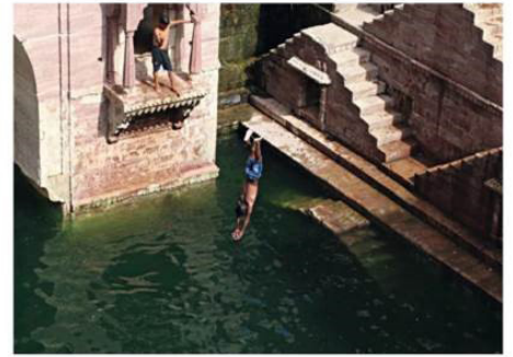
The step well is a key water storage facility that is unique to India. In the 2nd century, thousands of step wells were built all over the country. Most have dried up due to the drop in groundwater levels in India. The Torji Ka Jhalra, managed by luxury heritage hotel Raas Jodhpur, is a smaller but well-preserved example of the step well. Here, it is common to see youngsters dive into the step well for fun. 阶梯井是印度独特的关键储水设施。公元二世纪时，成千上万的阶梯井在全国各地建成。由于长期以来越发地下水位下降，大部分阶梯井已经干涸。在久隆浦的Raas酒店管理的Torji Ka Jhalra阶梯井是个小但保存得非常好的一个，经常有许多当地年轻人喜欢跳进去玩。